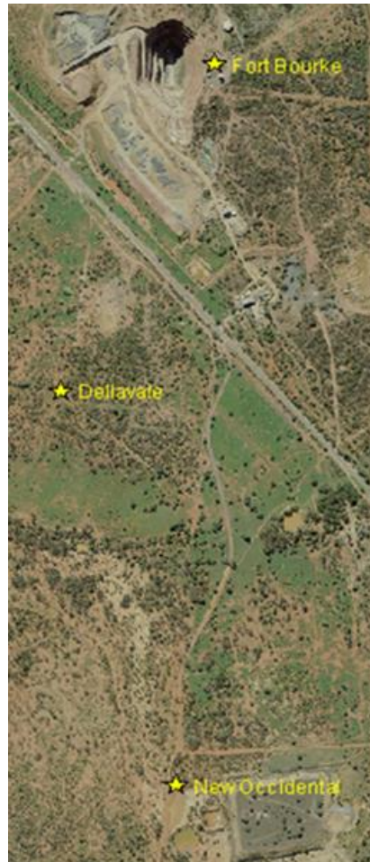
Figure 1: Location of Vibration Monitors on PGM's Mining Leases.