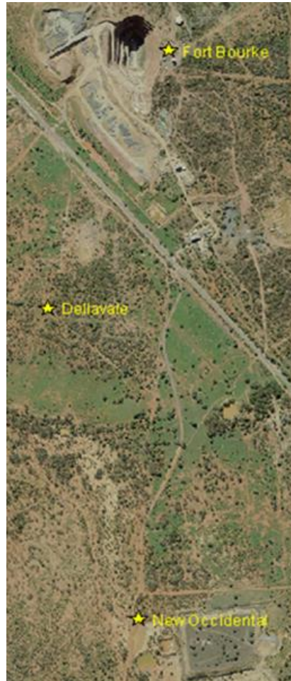
Figure 1: Location of Vibration Monitors on PGM's Mining Leases.